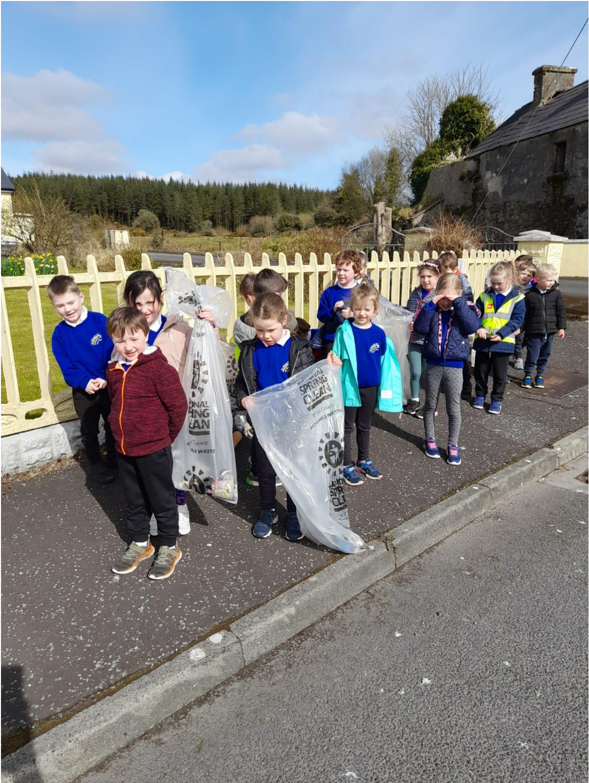
Tired but happy children.